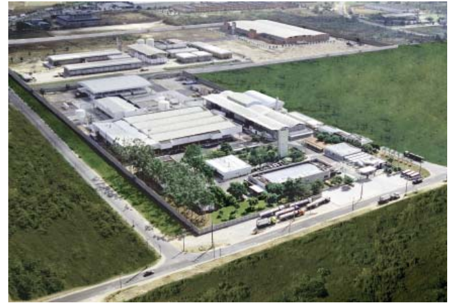
Aerial view of Nufarm Brazil

In order to offer more safety to staff, Nufarm trained 17 employees from different sectors as volunteer first aiders, thus contributing to the medical service. This group was trained to provide first aid before the victim is taken to medical facilities. For this purpose, emergency kits were placed all over the site for paramedical care containing stretchers, neck holders, and other first aid supplies. In 2008, we responded positively to the increasing demand for new safety corporate procedures across the site. 14 new safety procedures were successfully implemented pertaining to Incident Communication and Investigation, Accident Communication and Investigation, Personnel Access Control, Risk Work Authorisation, Contractors, Safety Integration, Waste Disposal, Working Environment, High Place Work Safety Measure, Excavating Work, High Temperature Work, Use of Safety Equipment, and Safety Tags.