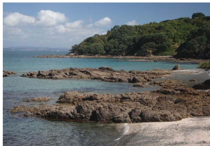
Tiritiri Matangi Island

Nufarm staff members have assisted as volunteers with weed control on Motuihe Island and there is an annual visit to Tiritiri Matangi Island to observe the rare birds in their natural habitat.