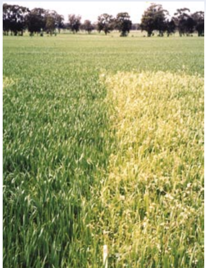
Left: treated with Avadex Xtra Right: untreated control.

Two to three weeks after sowing, check the performance of Avadex Xtra by scraping back the soil to see dead and dying Wild Oats.