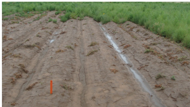
May 27, 2015 – 40 days after application of Scorch at 1.0 pint/A. Lubbock, TX – mixed population of kochia and Russian thistle in background.