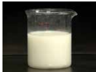
Even after two hours, Tuscany SC stays in suspension

See label for complete directions for use, including chemigation application rates and directions for use on potatoes.