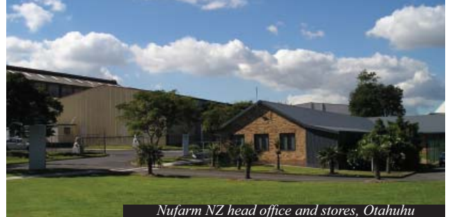
Nufarm NZ head office and stores, Otahuhu

Our operations produce minimal waste apart from some plastic wrapping, paper and cardboard. We recycle plastic containers where possible with the cooperation of end users and retailers. We have implemented return, wash and reuse schemes for 100 L drums, 100 L envirodrums, 200 L drums and IBCs of 500 L and 1000 L capacity.